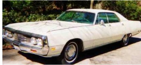
1969 Chrysler New Yorker

pattern, thus allowing parking on corner side streets. On his day off, usually a Tuesday, he would rotate them up one location and then drive the oldest one to work