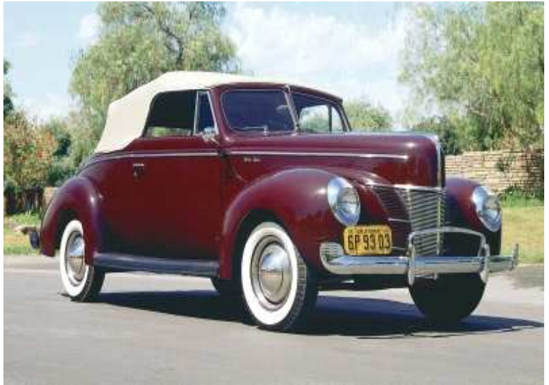
Ford stepped up the competition against Chevy with models such as this 1940 Deluxe Ford Convertible.

The '41s were the biggest, flashiest, and heaviest Fords yet. Wheelbase stretched two inches to 114, bodysides ballooned outward, and a stouter frame contributed to an average 100 pounds of added curb weight. Styling was evolutionary, with wider, more-integrated front fenders; a busy vertical-bar grille with tall center section flanked by low subgrilles; larger rear