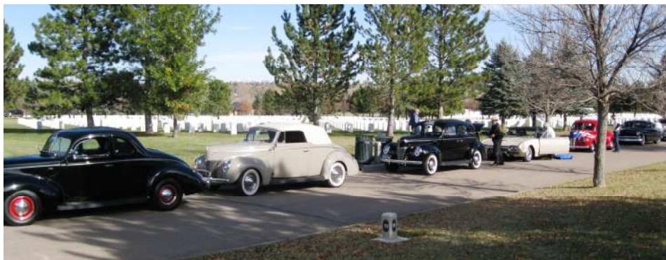
A good turnout of Early V8's were on hand for the Veteran's Day ceremony at the Ft Logan National Cemetery